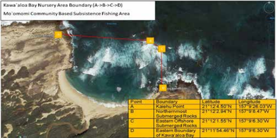
Kawa`aloe Bay Nursery Area Boundary (A->B->C->D) Mo`omomi Community Based Subsistence Fishing Area

No operating a vessel or conducting any other activities that may disturb the marine environment within the Kawa`aloe Bay Protected Area